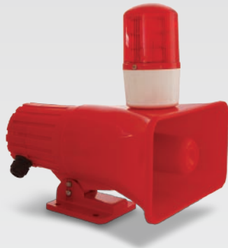
BC-3B / BC-3BF