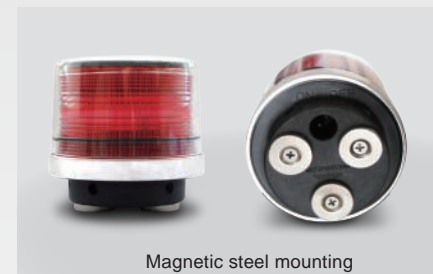
Magnetic steel mounting